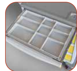
ISO Trays (dividers sold separately)