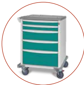
Shown in Green

Exceptional storage in a common cart size