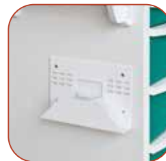
Plug Outlet Holder