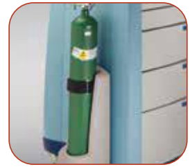
Oxygen Tank Holder