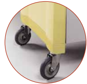
Spread Caster Position provides stability control by moving the wheels out toward the corners of the cart frame