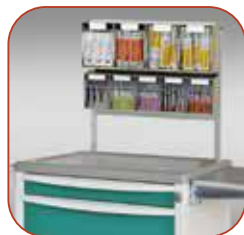
Bridge Tilt Bins