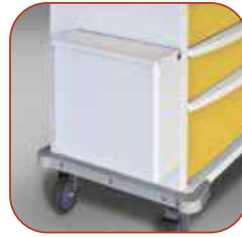
Waste Container w/ Lid