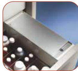
Internal Lock Box