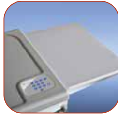
Extended Work Surface