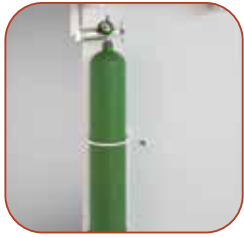
Oxygen Tank Bracket