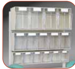
Tilt Bin Organizers