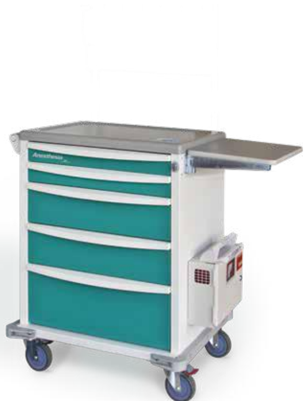
I-Series Anesthesia Cart with accessories