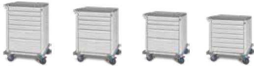
Standard Intermediate Compact Mini

Choose from five (5) standard drawer packages