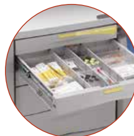
Integral Drawer Dividers offer the flexibility to organize and re-arrange drawer contents

A sturdy work surface offers ample room to efficiently prepare I.V. solutions. Expand your work area with a sizable slide-out work surface, positionable on either the right or left side of the cart.