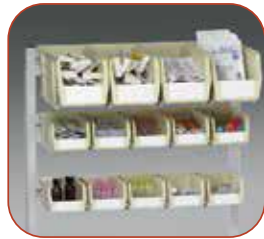
Bulk Storage Bins