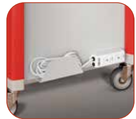
Plug Outlet Strip UL1363A Rated