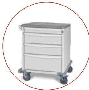
Shown in White

For applications requiring less capacity and smaller size