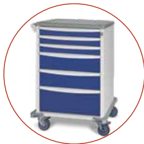
Shown in Blue

Maximum capacity, storage room and organization