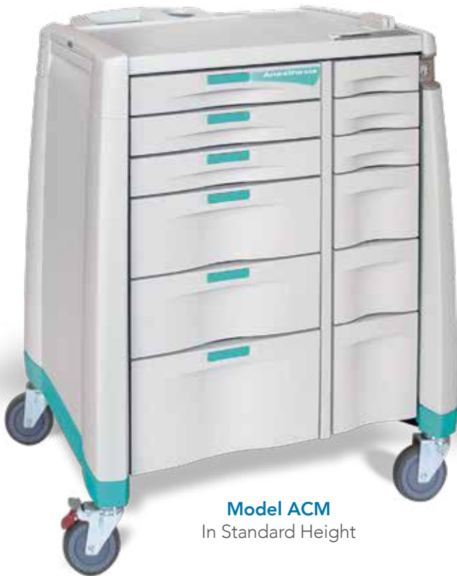
Model ACM In Standard Height

An innovative keyless access and automatic relocking system provides secure and safe storage of anesthesia medications. Add another layer of security with an optional ID Badge card reader, or optical bar code scanner and cart user audit.