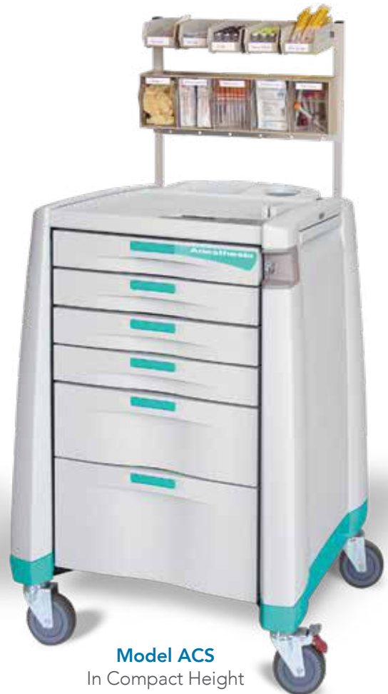
Model ACS In Compact Height