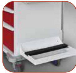
Suction Pump Shelf