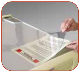
Clear Top Mat