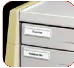
Drawer Tag Holder