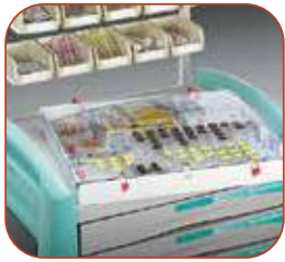
Divided Drawer Tray