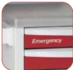
Cart I.D. Labels