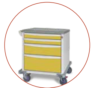
Shown in Yellow