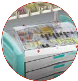
Removable Drawer Trays