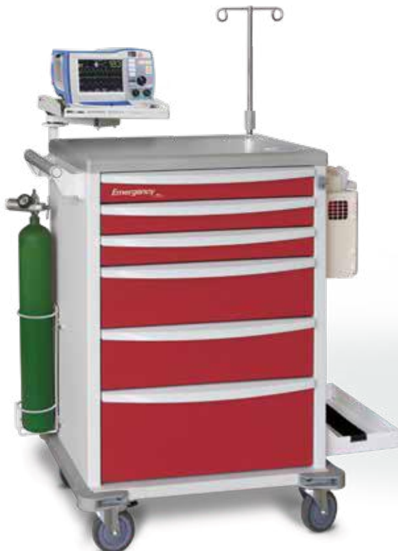
I-Series Emergency Cart with accessories

All I-Series carts are constructed of lightweight aluminum panels, sturdy internal frame, and premium drawer slides to ensure long-term value and durability.