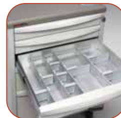
Drawer Flex Divider System