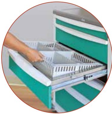
I-Series carts can accommodate a variety of ISO trays and baskets.

The maximum flexibility of the I-Series platform is evidenced by a wide array of cart models that