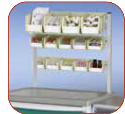
Bridge Storage Bins