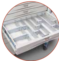
Drawer Flex Dividers